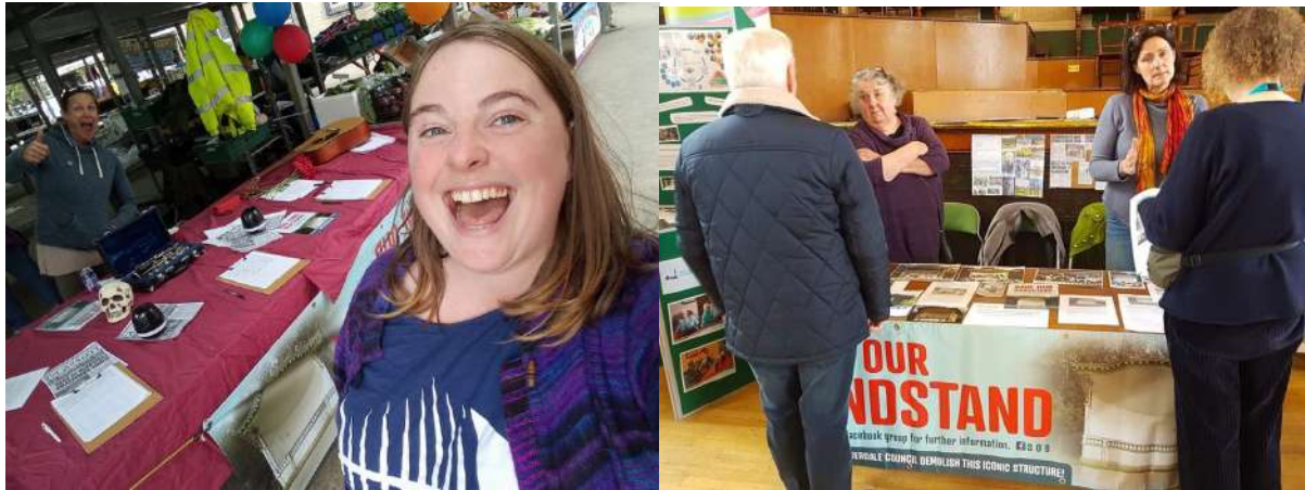
TCBG working on community engagement at Todmorden Market (August 2019) and Todmorden Town Hall (February 2020)