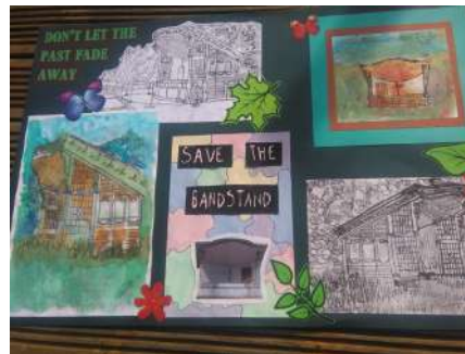
Artwork by Todmorden High School students on display at the Platform One gallery, Todmorden, March 2020